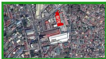
CityMall - Dau, Pampanga