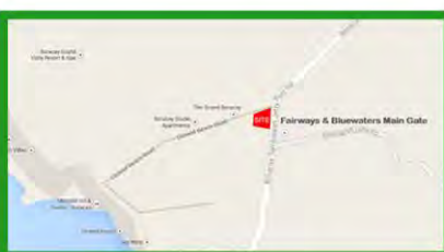
CityMall - Boracay