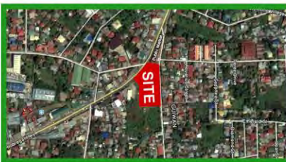
CityMall - Guiwan, Zamboanga