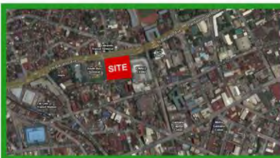
CityMall - Bacalso, Cebu