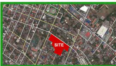
CityMall - Kalibo, Aklan