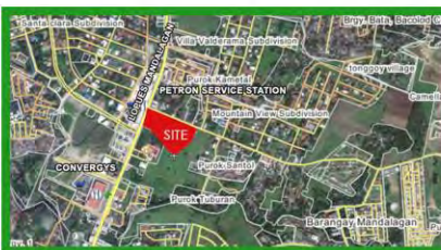
CityMall - Mandalagan, Bacolod