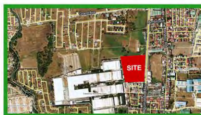
CityMall - Anabu, Imus Cavite