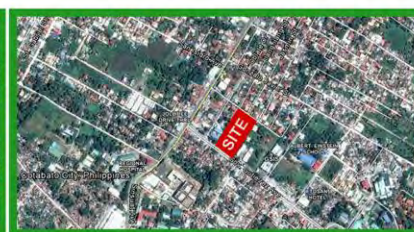
CityMall - Cotabato