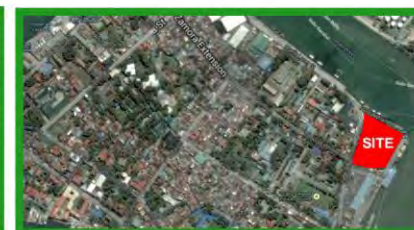
CityMall - Parola, Iloilo