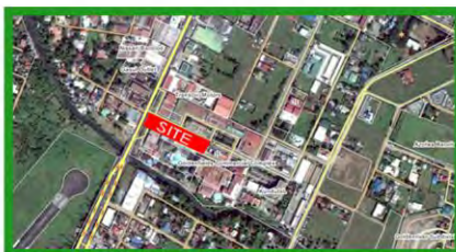
CityMall - Goldenfields, Bacolod