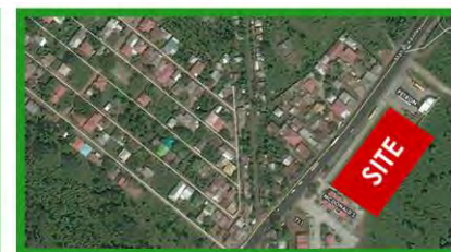
CityMall - Tiaong, Quezon