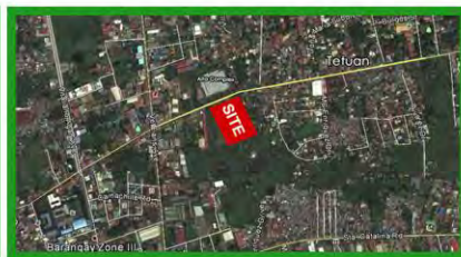
CityMall - Tetuan, Zamboanga