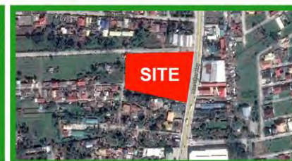
CityMall - Tarlac City