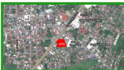
CityMall - Tagum City